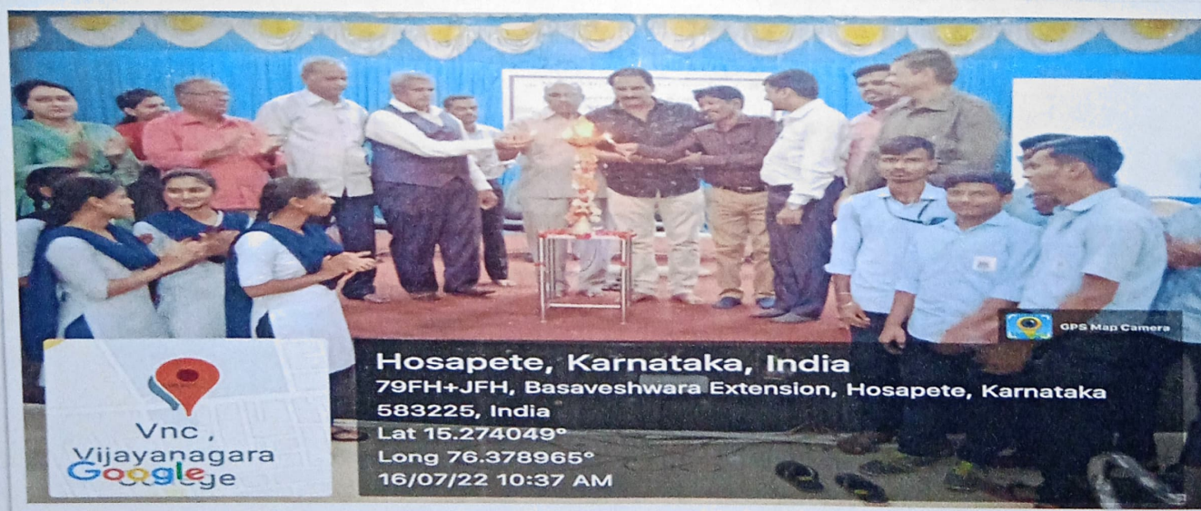
Inauguration of invited lecture program by lightning the lamp